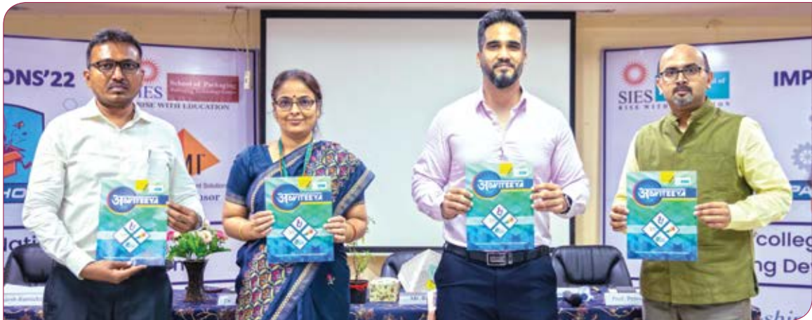
Magazine Release during Packathan event a PPT Department Initiative