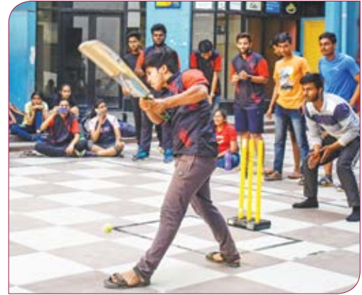
Box cricket event