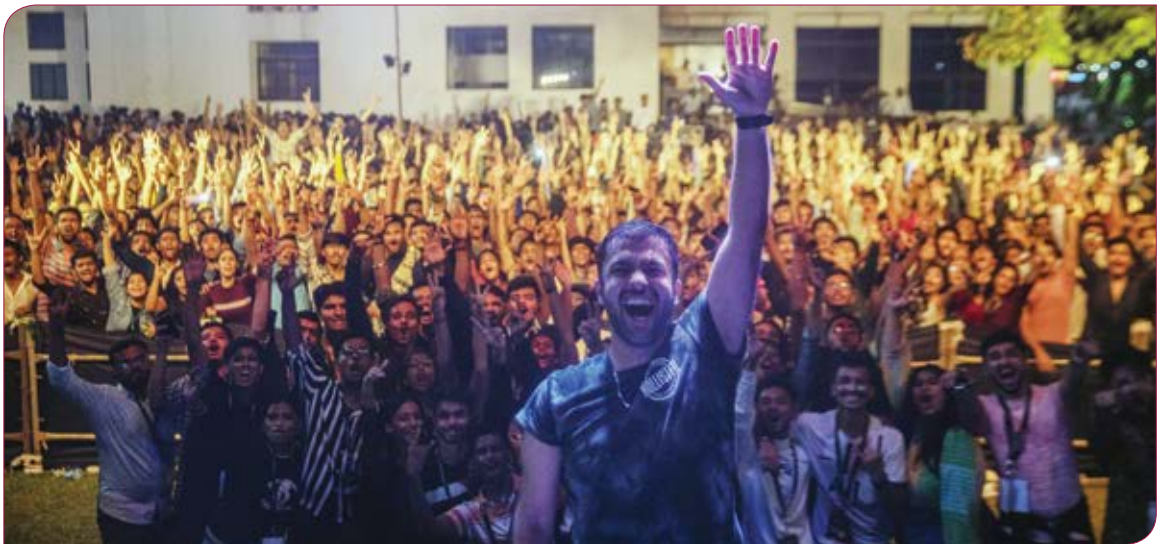
DJ Night during TML Annual Cultural festival

Tatva Moksha Lakshya, our cultural fest of SIES GST was carried out on 31 st March & 1 st April 2022. Not only GSTians but students from colleges across the city actively indulged in all the various events, games and competitions.