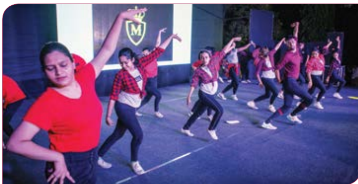
Group Dance events during TML Annual Cultural festival