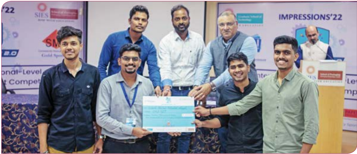
Event Impressions under PPT Department