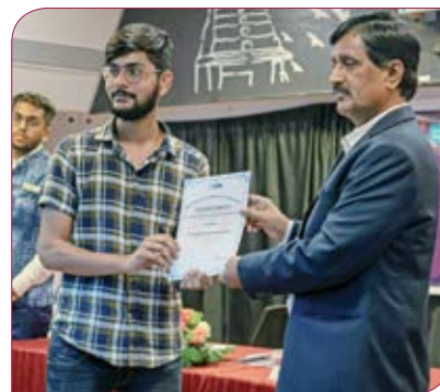
Endowment award distribution

11 th and 12 th of September 2021 where students were given exposure to various related topics with a hands-on session to give them a better understanding of the topic