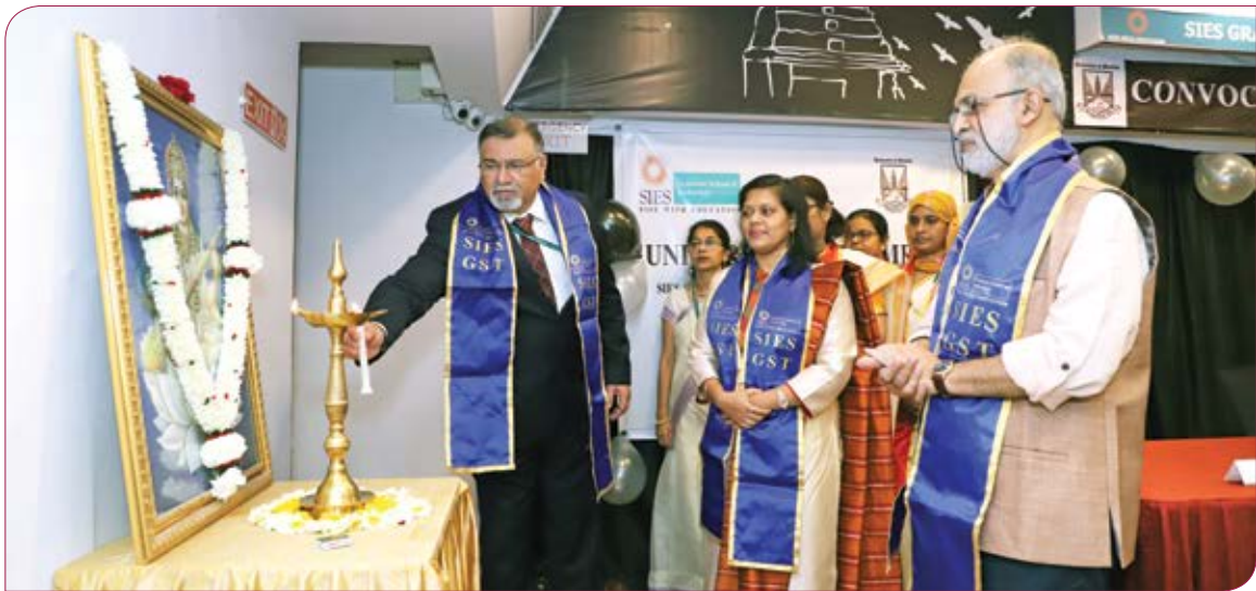
Convocation ceremony held on 12.3.2022 for the batch 2020-21

have submitted their work to the allocated judges as well as their classmates. A total of 14 teams (65 students) participated in Round 1 of Promethean 2022.