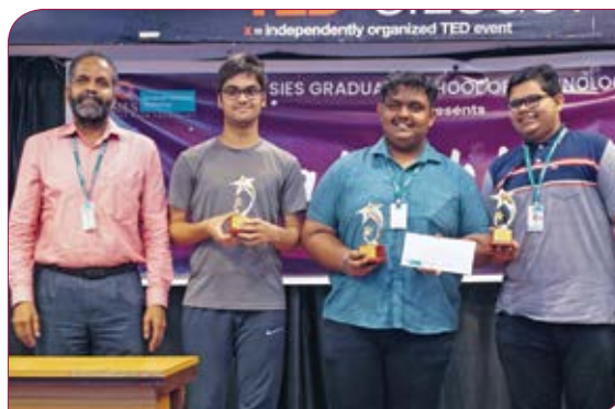
Event Matrix Quiz competition